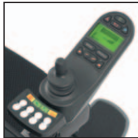
R-Net option (10 km/h). Alternative Drive Controls available. (Option)