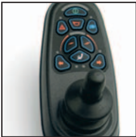
VR2 electronics. (Standard)