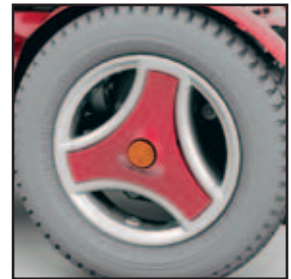
Tri-spoke split rims with color matching hubcaps. Solid or air filled.