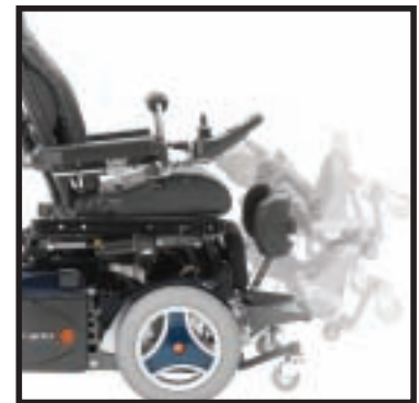
Power adjustable legrests operate independently from power adjustable recline