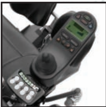
R-Net electronics with ICS

Power sit to stand from any position. Drive at reduced speed in standing position.