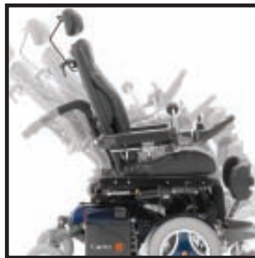
Power adjustable tilt