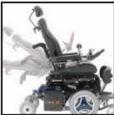
Power adjustable recline