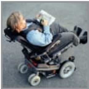
Optional tilt adjustment enables the seating system to tilt up to 25 degrees

The Corpus seating system's modular design provides enhanced functionality through adaptable seat sizing and electric adjustments. The Corpus is designed by one of the leading ergonomic experts in the world resulting in a seating system that is fully adapted to the natural contours of the body. The adaptability of the Corpus seating system is limitless. Depth, width, height, and the angles of the various seat components can be adjusted or adapted. The ergonomically shaped seating and optional electric adjustments make the Corpus the world's most popular seating system.