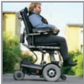
Optional seat lift enables the seating system to lift up to 20 cm