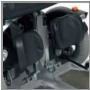
Calf supports are available in fabric or imitation leather as an option