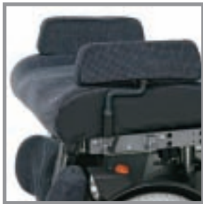
High supports are available in fabric or imitation leather as an option