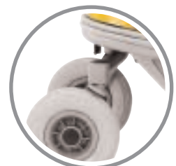
Pivoting rear wheels for responsive steering