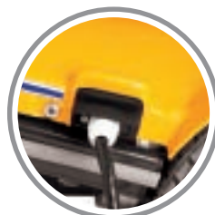
Easily accessible charging point