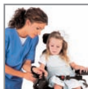
The simple joystick controls are ideal for small children