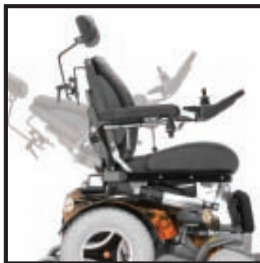
Power adjustable recline

ISO 7176-19 / ISO 10542-3 EN12182/EN12184