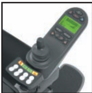
R-Net-elektronica met ICS