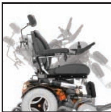
Power adjustable tilt