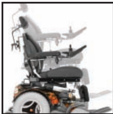
Power seat height adjustment