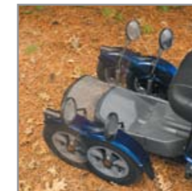
Wheelbase can be elongated and adjusted to suit your needs