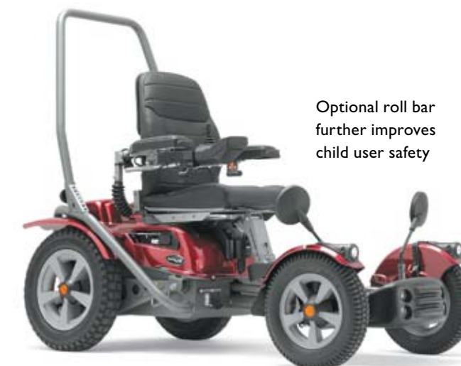
Optional roll bar further improves child user safety