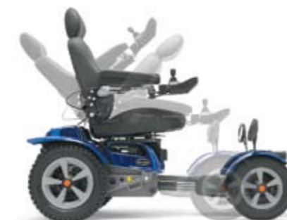
Manual backrest angle adjustment