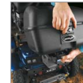
Demountable baggage box