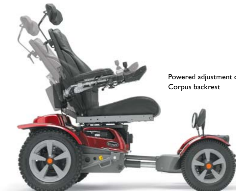
Powered adjustment of Corpus backrest