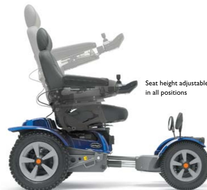
Seat height adjustable in all positions