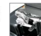
180° seat swivel, manual or powered