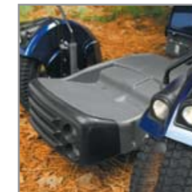
Multi directional headlights