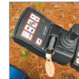
Control panel key lock