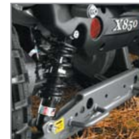
Upgrade independent suspension