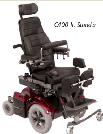
C400 Jr. Stander

Katie stands everyday. Most of all she enjoys the seat elevator—when shopping, she can reach the items and if her view is blocked, she elevates herself to see better.