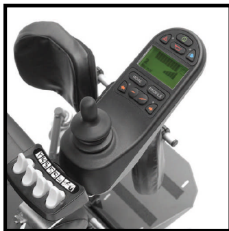
R-Net electronics with ICS