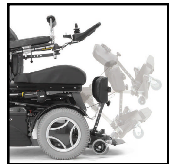
Power adjustable legrests operate independently from power adjustable recline