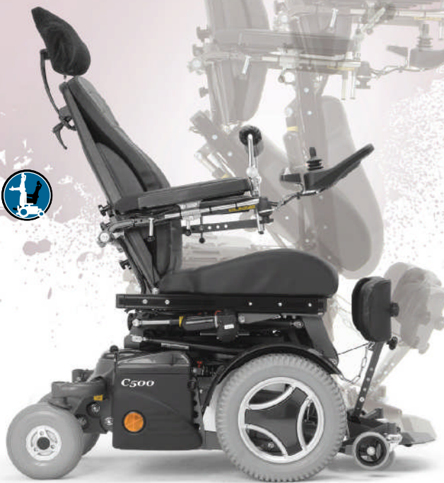
Power sit to stand from any position. Drive at reduced speed in standing position.