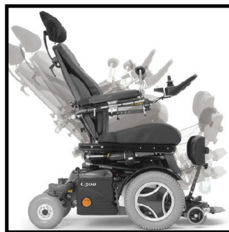
Power adjustable tilt to 25°