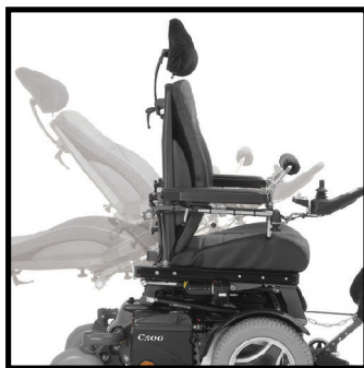
Power adjustable recline operates independently from power adjustable legrests