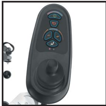
VR2 electronics standard with PS seating system