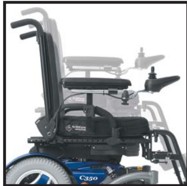
Power seat elevator

*shown with optional after-market seat cushion