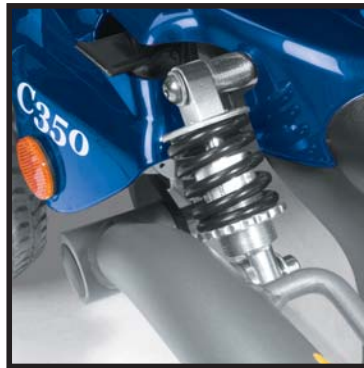
4-wheel adjustable independent suspension