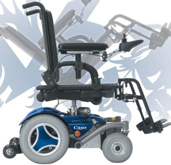
Power adjustable tilt