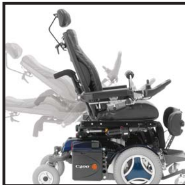
Power adjustable recline operates independently from power adjustable legrests