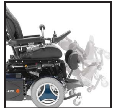
Power adjustable legrests operate independently from power adjustable recline