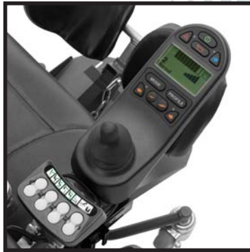
R-Net electronics with ICS