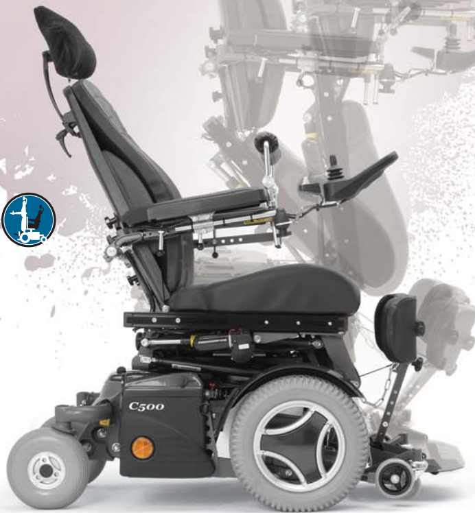
Power sit to stand from any position. Allows driving at reduced speed