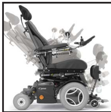
Power adjustable tilt