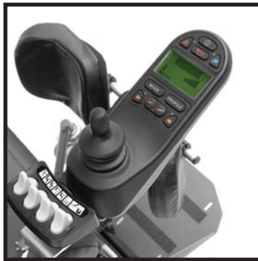
R-Net electronics with ICS for advanced programmability.