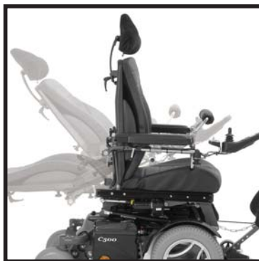
Power adjustable recline