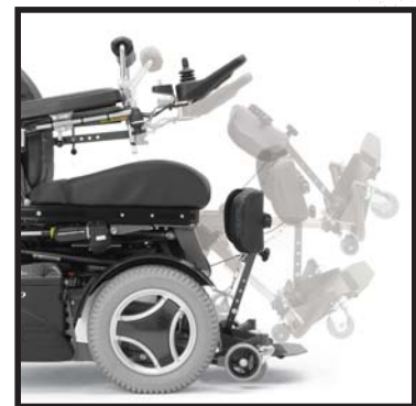
Power adjustable legrests operate independently from power recline