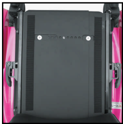
Adjustable seat pan fits kids of all sizes