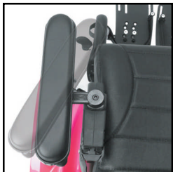
EZ adjust armrests easily adjust height angle and rotation