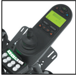
R-Net electronics with ICS