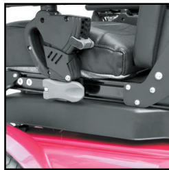
Uni-track system allows for extensive customization