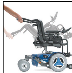
Optional stroller handle with manual tilt feature easily adjusts handle height without tools