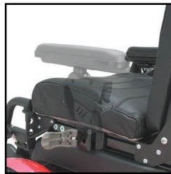
One-step removable armrest