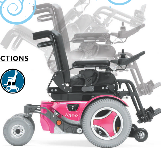
Power seat elevator and power tilt